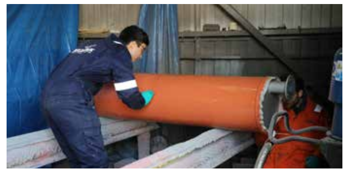
Application onto a seal pot

For more information, please contact your local Belzona representative: